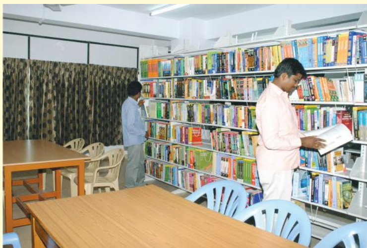
Learning Resources Centre

Note: Legal matters, if any, must be settled within the purview of Visakhapatnam jurisdiction only.